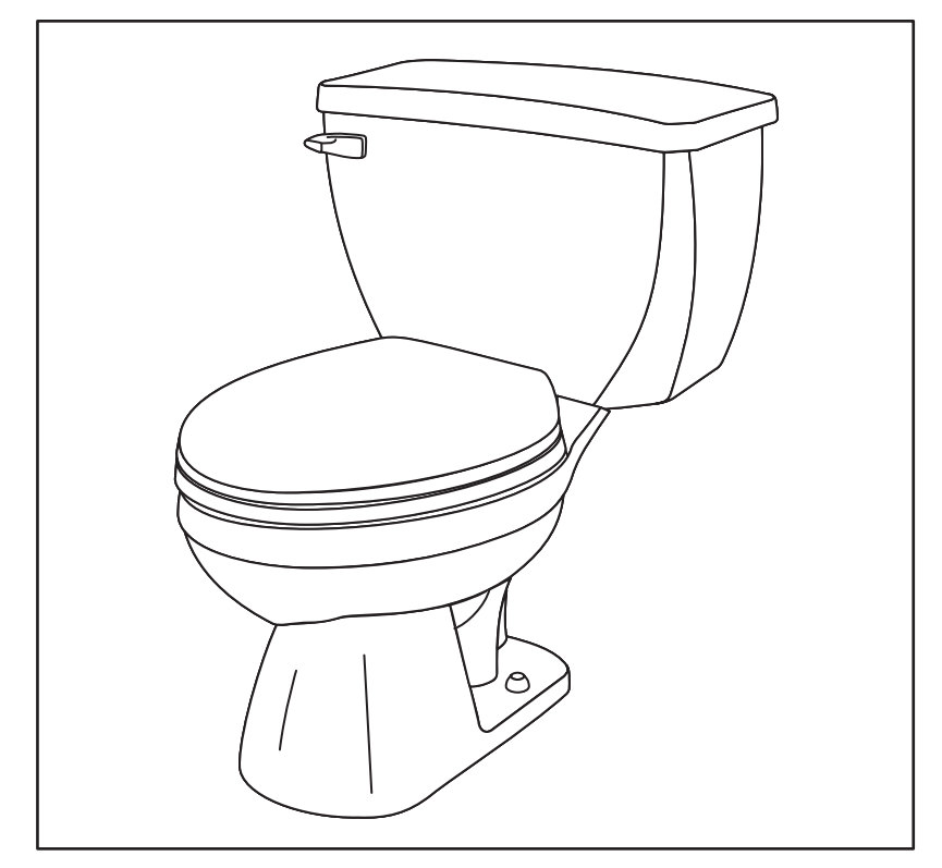
Specifications: Bowl —#21-372 Elongated Bowl Seat not included